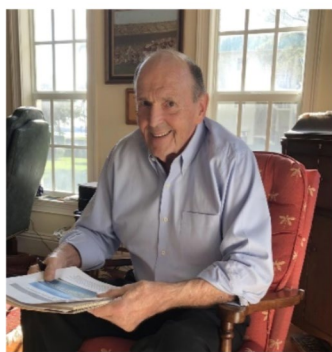
Mayor Alan Fiers